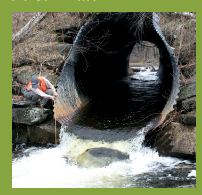
Road crossings with an outlet drop create a barrier in the stream that block fish passage.

The Committee is offering member towns preliminary engineering site assessments for stream crossings to help identify aquatic habitat restoration sites. Selected projects will be eligible to receive technical services by consultants via contract with the Committee.